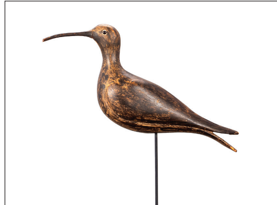
The Harmon Hollow Nantucket curlew, circa 1850 ($150/250,000).

PLYMOUTH, MASS. — On July 14 and 15, Copley Fine Art Auctions, the decoy and sporting art auction house, will conduct its 17th annual Sporting Sale. This auction, consisting of 675 lots, one of the company's largest to date, will offer buyers the opportunity to acquire world-class paintings, antique decoys, bird carvings, folk art and powder tins from important collections. The auction will be live-streamed and will utilize phone, absentee and internet bidding on three different online platforms, including CopleyLive, Bidsquare and Live Auctioneers. The auction will begin at 10 am on both Thursday and Friday.