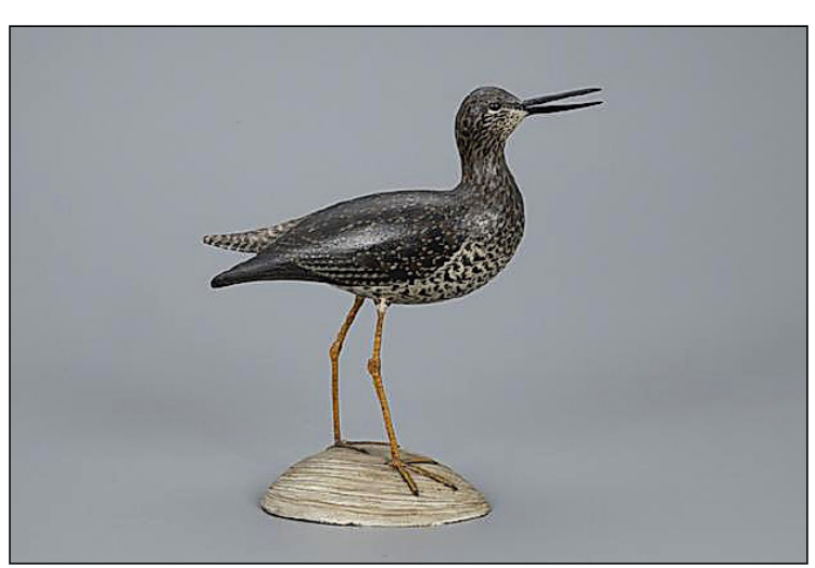
It wasn't a surprise that Elmer Crowell's calling yellowlegs earned $90,000, its high estimate. It has an open beak, dropped wings, upswept tail and more. Beautifully painted, with just minor wear, it was the second highest priced decoy in the sale.

$447,000, eight were decoys. In all, more than 20 items sold for five-figure prices. This was Copley's first online-only sale and it went smoothly, live-streamed on Bidsquare. Peter Coccoluto handled the podium duties and the sale was easy to follow. Artwork accounted for about one-third of the total, $311,000, decoys accounted for the balance,