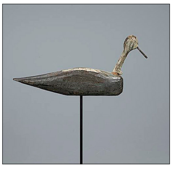
For those interested in folky decoys, this "peg headed" example from North Carolina may have been a bargain. The head was removable for easy transport and it realized $300.