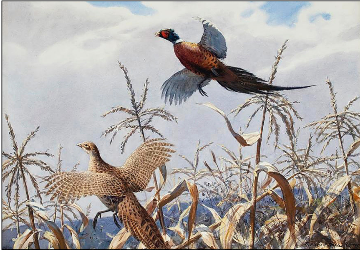
Aiden Lassell Ripley's watercolor, dated 1948, showing a pair of ringneck pheasants taking flight from a marsh, finished at $16,800.