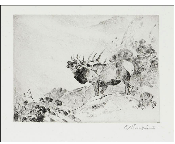
The sale started off with a selection of etchings by Carl Rungius. "The Challenge," depicting an elk, sold for $3,000.