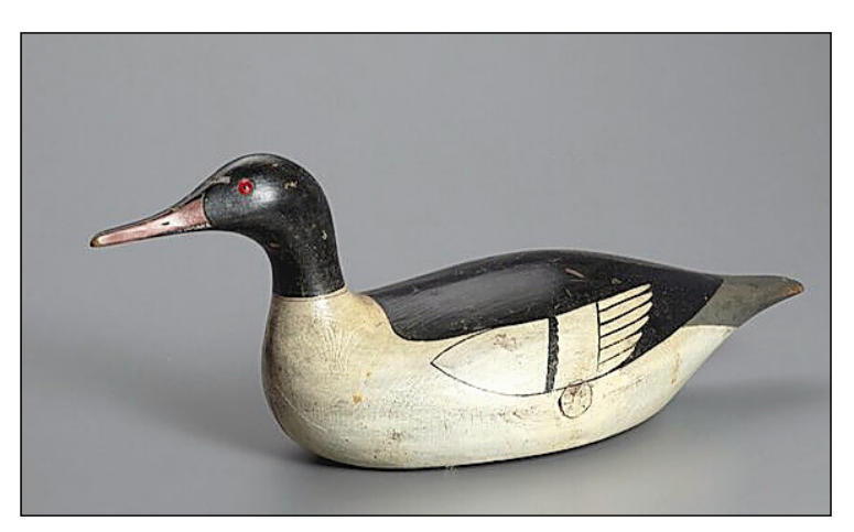
With an impeccable provenance, including the Starr collection, Joe Lincoln's American Merganser drake realized $45,000.

Prices given include the buyer's premium as stated by the auction house. For information, 617-536-0030 or www.copleyart.com.