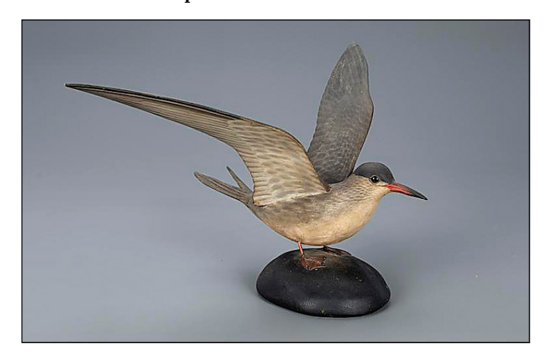
A life-sized alighting tern by Elmer Crowell with a wing spread of more than 19 inches earned $16,800. Circa 1930, it was cataloged as "possibly unique" with minor paint restoration.