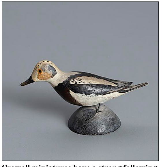
Crowell miniatures have a strong following, and this sale had several. This one, a long-tailed duck, reached $1,080.