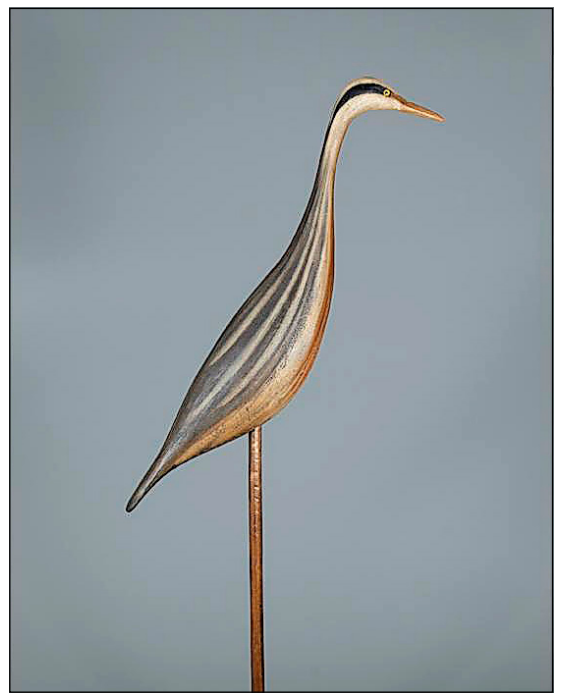
A life-sized heron, more than 34 inches tall and carved in 2000 by David B. Ward, went out for $2,520.