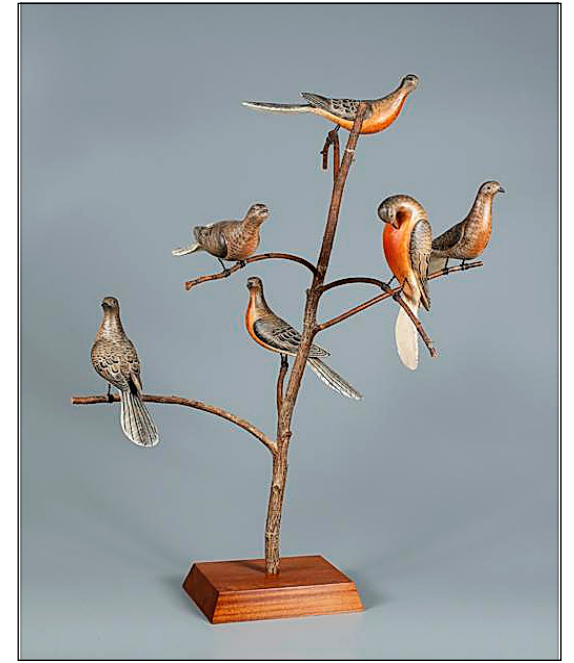
Bird trees are still popular. This one, 40 inches tall, had six now-extinct passenger pigeons resting on its branches. Carved by Ken Kirby in 2014, it brought $1,560.