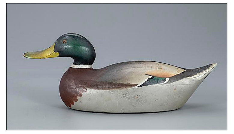
A Mason Factory mallard drake reached $16,800. In excellent condition, it had been owned by a bank president and stored in the basement of the bank for more than 40 years.