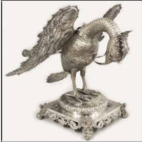
featuring a private collection of Spanish Colonial silver shown: a rare silver pelican-form book stand, 19" tall; 148 troy oz.

57 BAY STATE ROAD ♦ CAMBRIDGE, MA 02138 ♦ (617) 661-9582