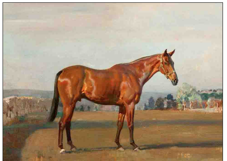
"Traveler" by Sir Alfred James Munnings (English, 1878-1959), 1924, oil on board, 20 by 24 inches ($80/120,000).