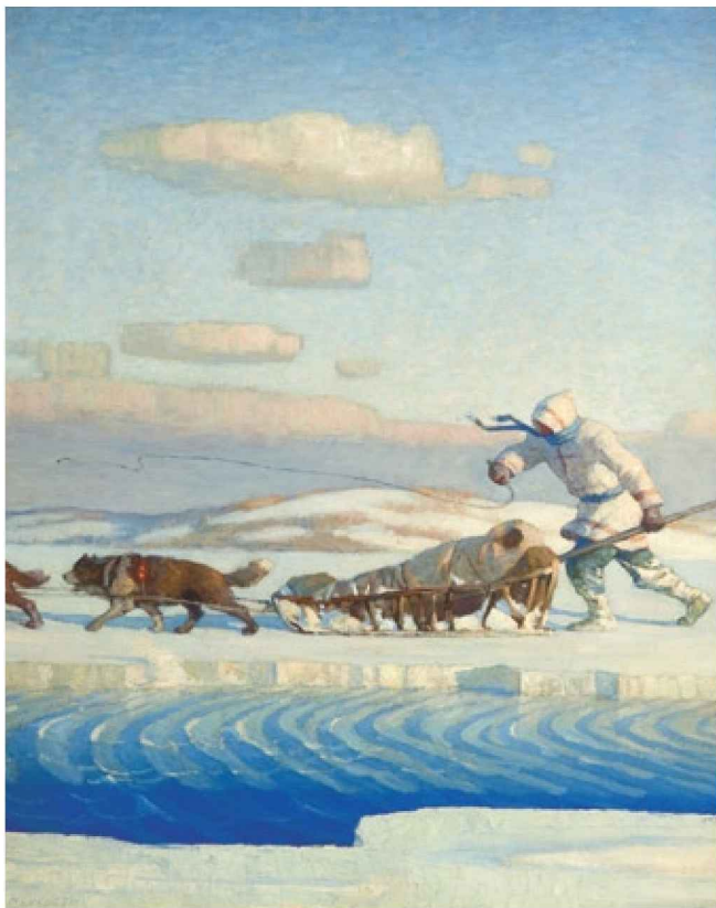
N.C. Wyeth (1882-1945) , One January Afternoon , 1915, oil on canvas, 20 x 16" Estimate: $100/150,000