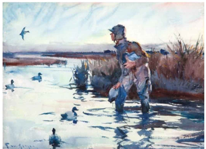
Frank W. Benson (1862-1951), Hunter with Retriever , pair of watercolors on paper, 1926 (left), and Hunter with Decoys , 1926 (right), both 15 x 20" Estimate: $100/150,000