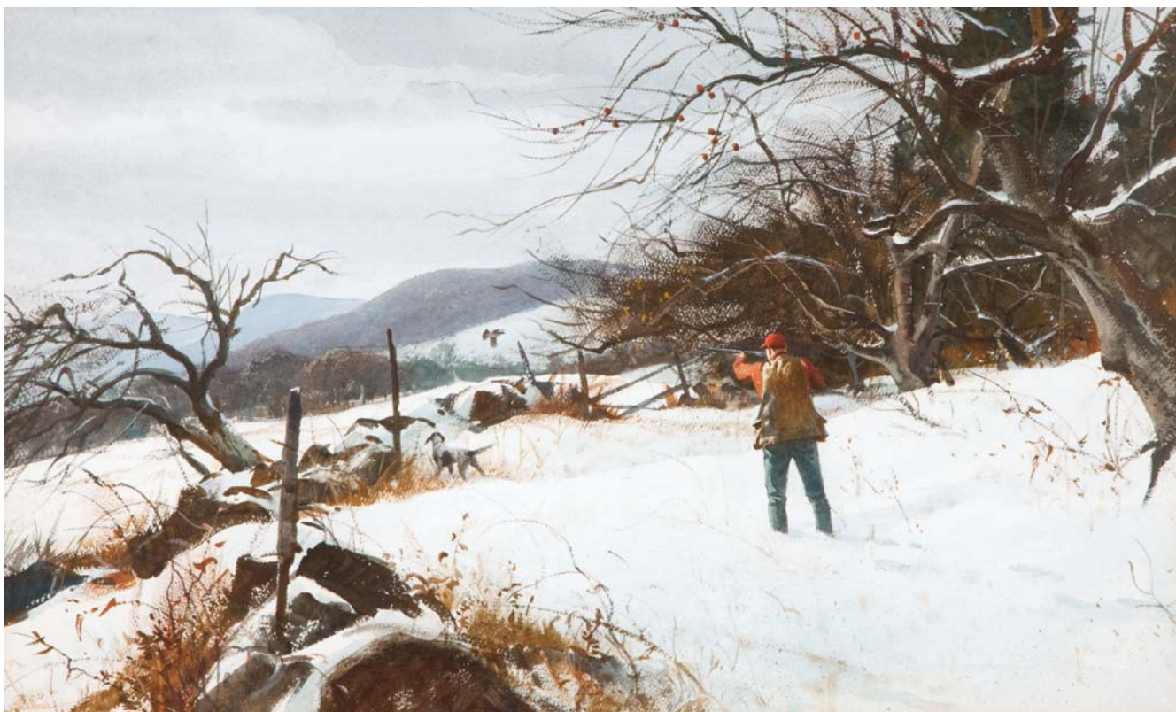
Ogden M. Pleissner , The Orchard Cover , watercolor on paper, 17 x 28" Estimate: $40/60,000 SOLD: $46,000