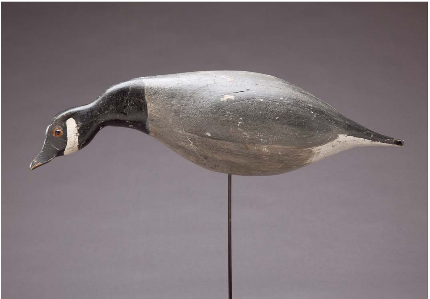
John Tax, Feeding Canada Goose Estimate: $40/60,000 SOLD: $115,000