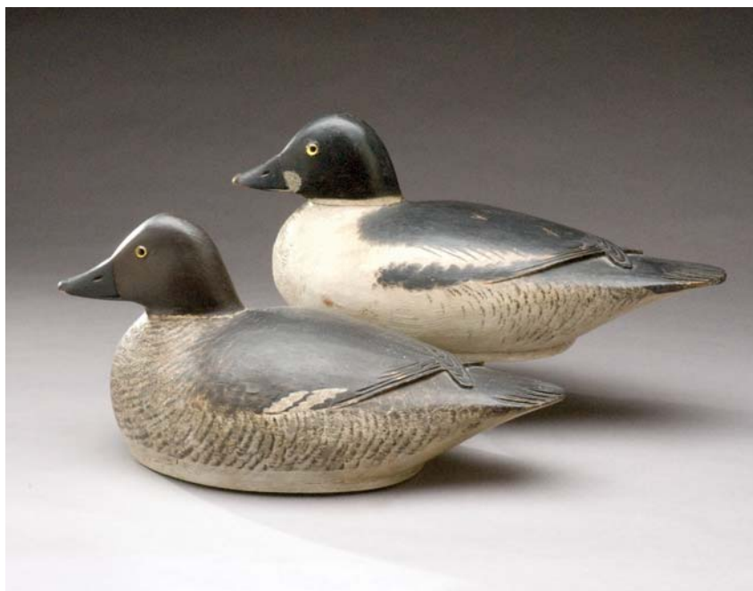
A. Elmer Crowell , Pair of Goldeneyes Estimate: $40/60,000 SOLD: $109,250