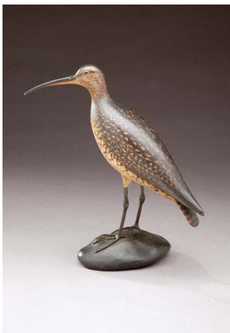
A. Elmer Crowell , Hudsonian Curlew Estimate: $60/90,000 SOLD: $74,750