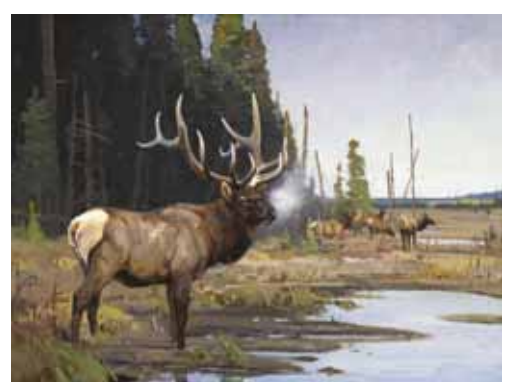
Luke Frazier (b. 1970), Pushing to the Meadow, oil on board, 34 x 48" ESTIMATE: $15/20,000